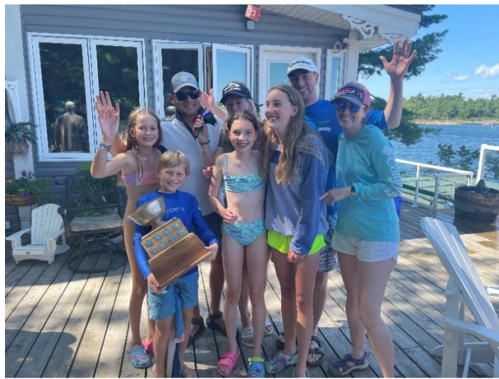
The “infamous” greased watermelon event & beautiful Kah She Island!